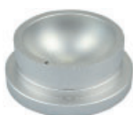
LBM009 Adapter for round bottom flask 500 mL