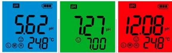
[3 color backlight display] Measurement mode Blue color