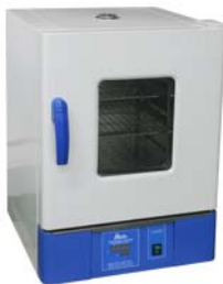
[01] Code 50636031 Capacity: 30 L