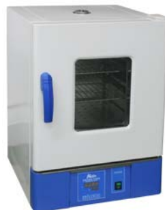
[02] Code 50636041 Capacity: 45 L