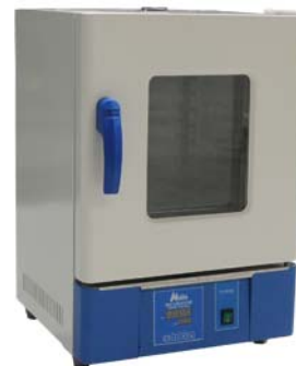
[03] Code 50636061 Capacity: 65 L