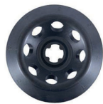
Angle rotor | GDF007 1.5/2 mL×8 4000 rpm/990 ×g 7000 rpm/2910 ×g 10000 rpm/5610 ×g