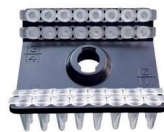
Angle rotor | GDF010 0.2 mL×8×4 4000 rpm/536 ×g 7000 rpm/1643 ×g 10000 rpm/3354 ×g