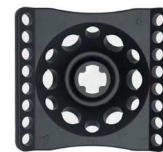
Angle rotor | GDF013 1.5 mL×6+0.5 mL×6+ 0.2 mL×8×2 4000 rpm/912 ×g 7000 rpm/2793 ×g 10000/5701 ×g