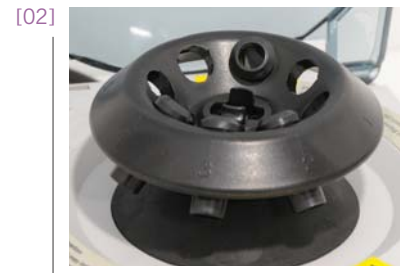
For 8 cryotubes: 8x1.5/2 mL, 8x0.5 mL*, 8x0.2 mL*