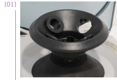
For 4 cryotubes: 4x5 mL, 4x1.8 mL*